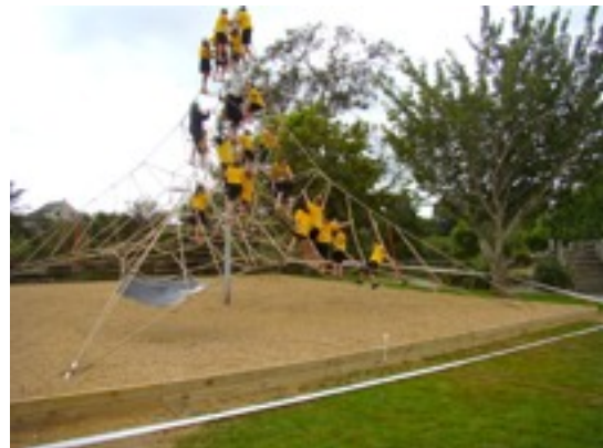
The finished product, eagerly trialled by our senior pupils