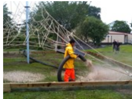
Work progressing on our new senior playground

It is exciting to see good progress on a number of property projects over the holidays that will enhance our school environment. We have had classroom wall cladding replaced where it was rotting, the memory garden improved by adding a pathway and a new seat to the quieter side of the garden. The senior playground funded by the PTA has been completed and the Year 5 and 6 children have enjoyed their first week on it. Finally the work on the staff carpark has started with the contract awarded to Schick Construction Company.